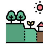
Land Use Survey

A simple drawing to capture the most important geographical features of a site.